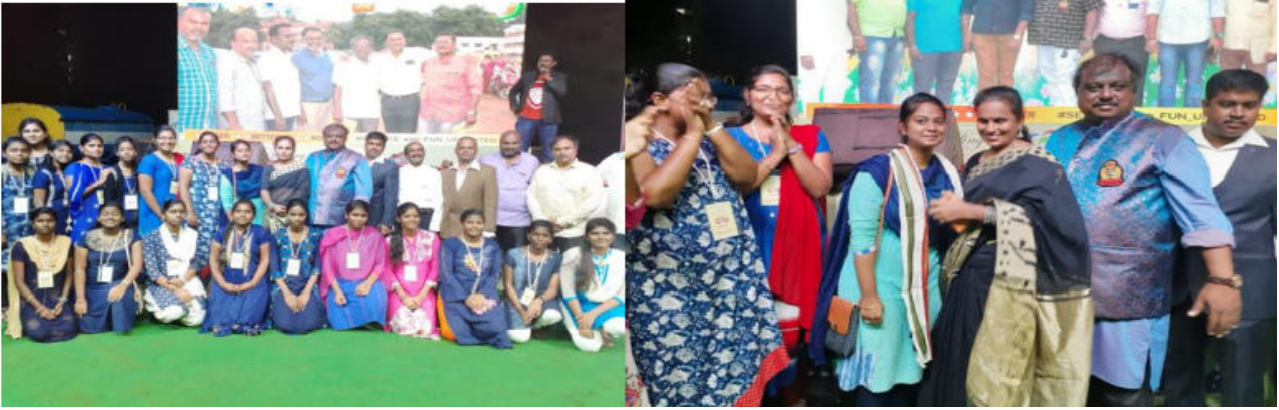
Women Empowerment Programme- 24.10.2019