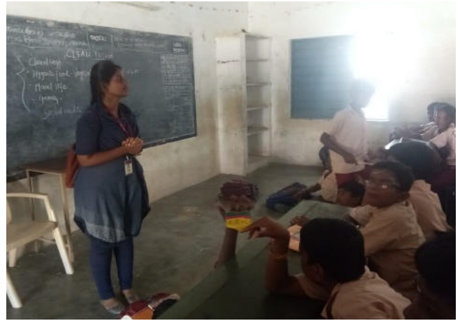
Swachh Bharath Awareness – 17.09.2018