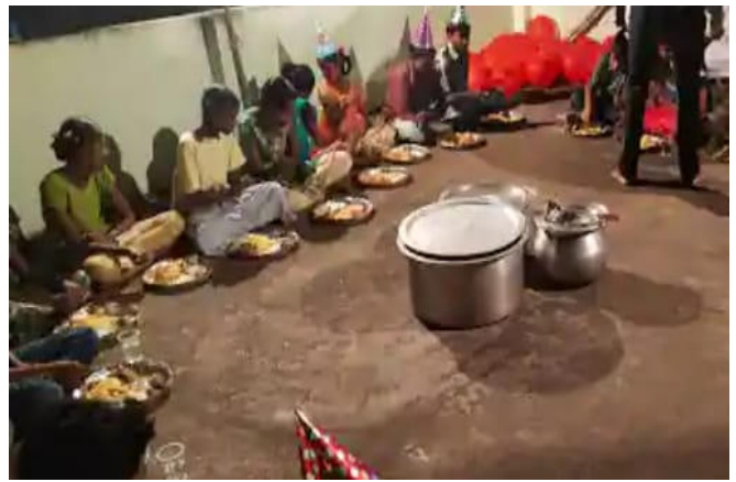
Programme in Orphanage - 13.10.2018