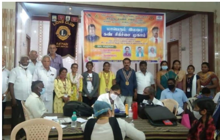
Eye Camp – 07.03.2021