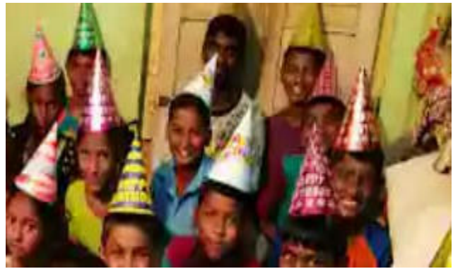
Cleanliness Awareness Camp - 02.09.2019