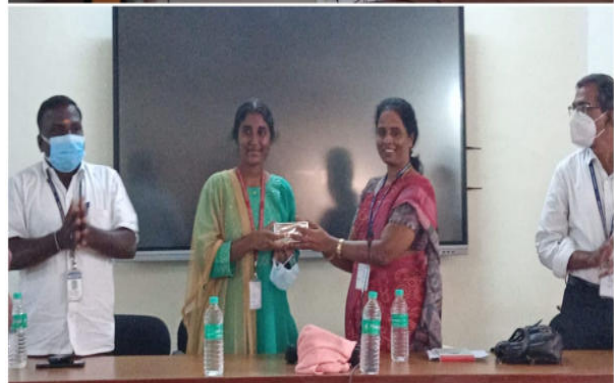
Electricity Consumption Week Special Rally and Elocution - 20.12.2021