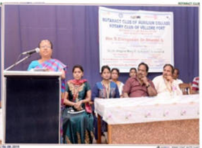
Intellectual well being Programme - 06.08.2019