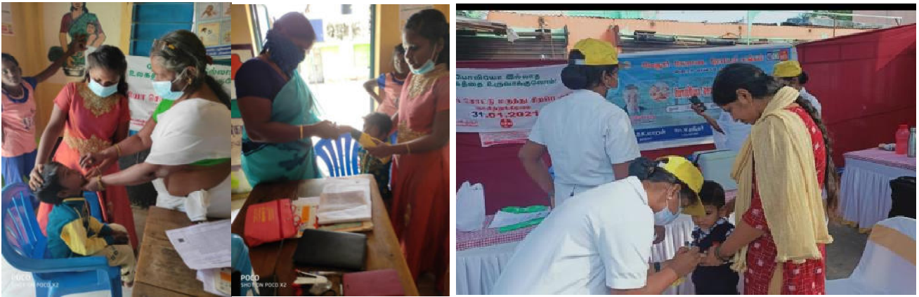
Polio Camp – 31.01.2021